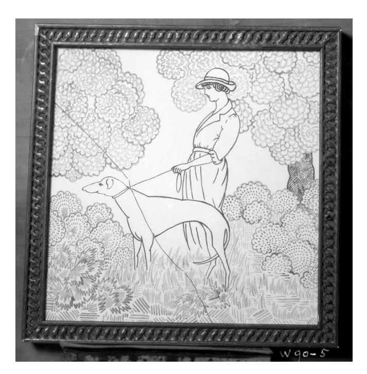
Girl with Dog Photograph negative of painted ceramic tile