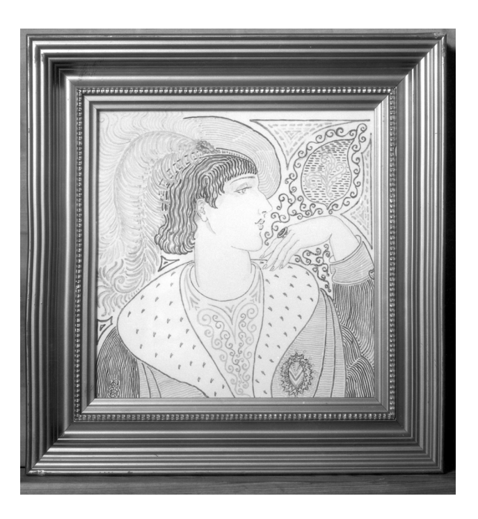
San Amant Photograph negative of painted ceramic tile