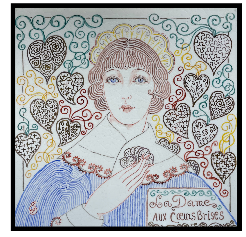
Grainger, Ella Viola Ström La Dame aux coeurs brisées Painted ceramic tile 8" x 8"

Portraits on Tiles , an illustrated article in The Sun (London) Sunday May 9, 1926.